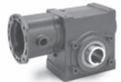
3-piece Coupled Input