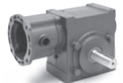
3-piece Coupled Input