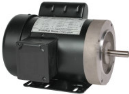
56C Flange Motors

General Purpose Motors Special Purpose Motors