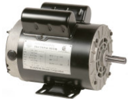
Compressor Duty Motors