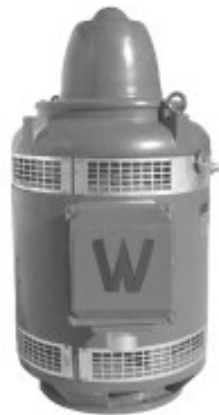
Vertical Hollow Shaft Motors