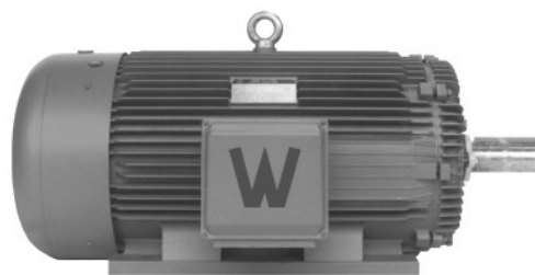
Rock Crusher Motors