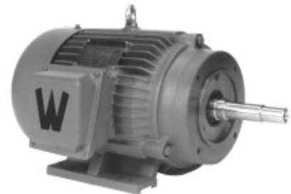
Close Coupled Pump Motors