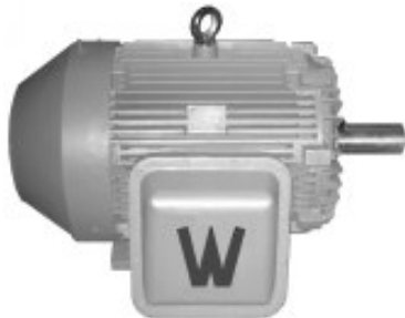
Explosion Proof Motors