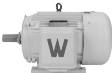
Oil Well Pump Motors