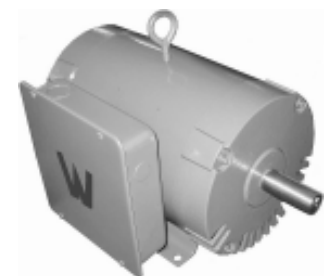
Single-Phase T-Frame Motors

“The Leader In Providing High Quality, Low Cost, Sourced Motors”