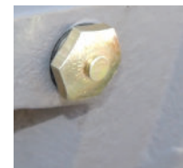
Grease pressure reliefs act to battle overgreasing