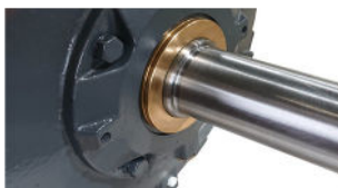
Labyrinth seals on both ends of motor