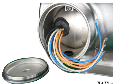
Fully Encapsulated Winding and Junction Box.